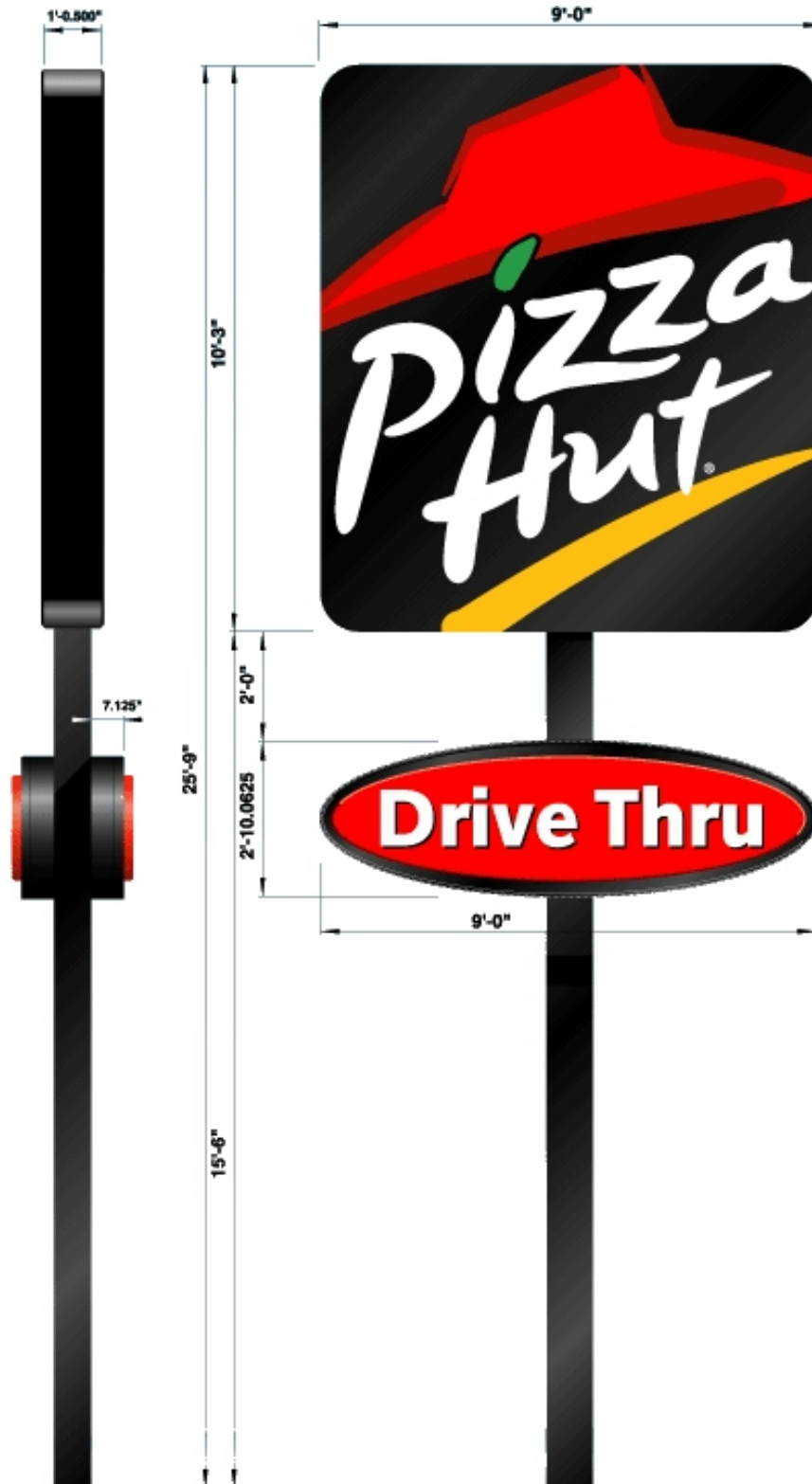
PYLON SIGN MODEL P-92