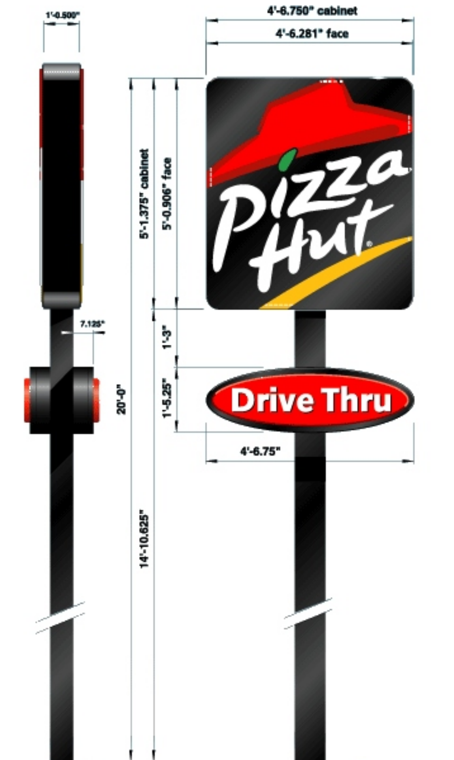
PYLON SIGN MODEL P-23